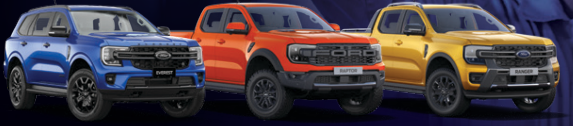
Next-Generation Ford Everest

Ford Extended Service Plan (ESP) takes care of your vehicle maintenance for up to 5 years, depending on the chosen plan. Enjoy savings on maintenance parts and labour while protecting yourself against any possibility of a price increase.